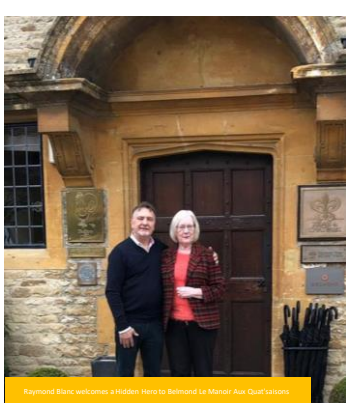
Raymond Blanc welcomes a Hidden Hero to Belmond Le Manoir aux Quat'Saisons