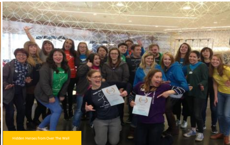
Hidden Heroes from Over The Wall