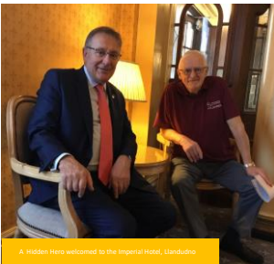
A Hidden Hero welcomed to the Imperial Hotel, Sandhurst