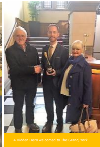
A Hidden Hero welcomed to The Grand, York