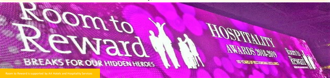
Room to Reward is supported by AA Hotels and Hospitality Services