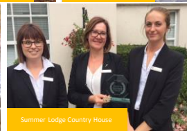
Summer Lodge Country House