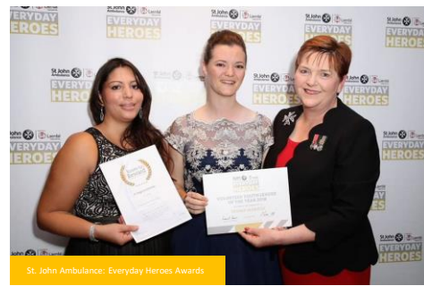
St. John Ambulance: Everyday Heroes Awards

Each nomination is read and approved by the R2R team. Every day, we read inspirational stories of people giving up their time to help those in need. Ordinary people doing extraordinary things. These are the Hidden Heroes . Without them, charities and communities simply could not survive. The support of our hotel partners enables us to recognise their impact, give them some time back, and say ‘thank you.’