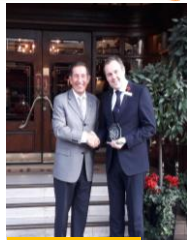
Rubens at The Palace