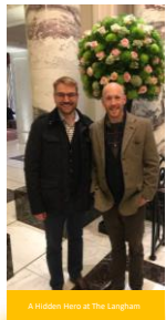
A Hidden Hero at the Langham