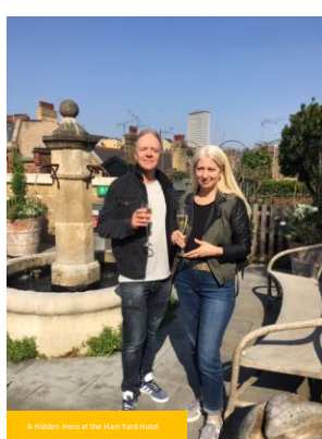
A Hidden Hero at the Ham Yard Hotel