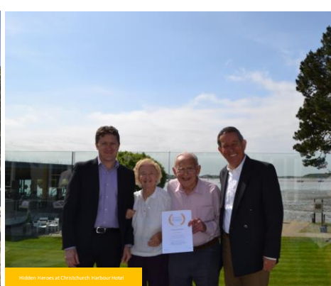
Hidden Heroes at Christchurch Harbour Hotel