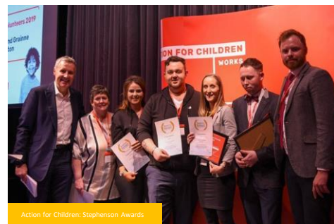
Action for Children: Stephenson Awards