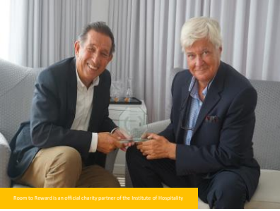
Room to Reward is an official charity partner of the Institute of Hospitality

“Room to Reward is a genius concept. Simple, effective and highly motivational. Collectively we can make a real difference to the lives of those who deserve our thanks and applause.