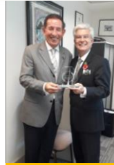
London Hilton on Park Lane

We are proud to offer a scheme that works for hotels of all shapes and sizes. As well as meeting CSR and making use of unsold rooms , the wonderful support of our partners is celebrated across our website and marketing channels. Each hotel also receives an R2R partner recognition award and the chance to nominate two local charities for us to approach and invite to join our scheme. Most of all, they truly make a difference .